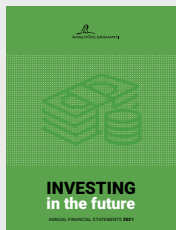
<AFS> Annual Financial Statements