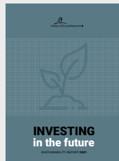
<SR> Sustainability Report