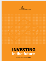
<IR> Integrated Report