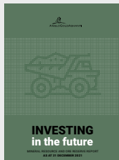
<R&R> Mineral Resource and Ore Reserve Report