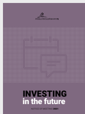
<NOM> Notice of Annual General Meeting and Summarised Financial Information (Notice of Meeting)